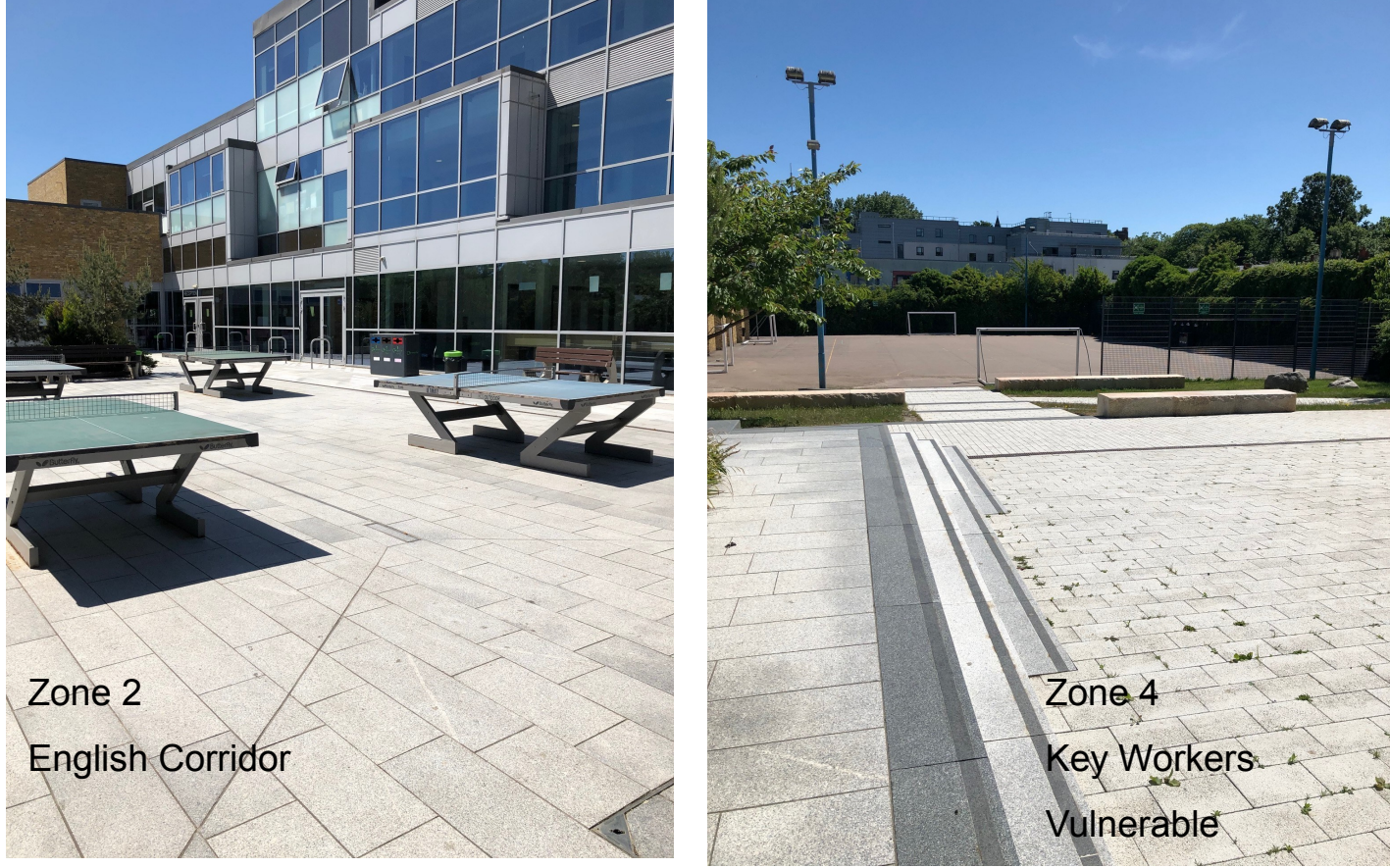
Zoned Outside Spaces for Break and Lunchtime