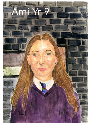
Ami Yr 9