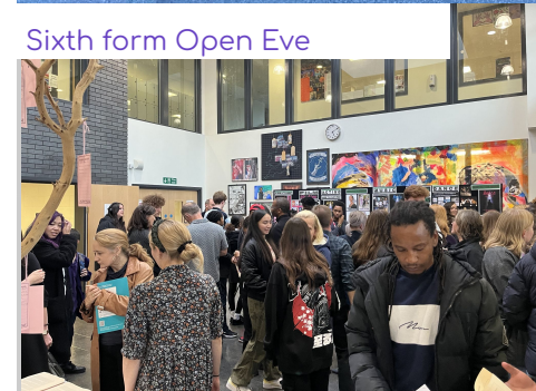
Sixth form Open Eve