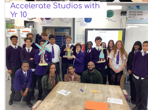
Accelerate Studios with Yr 10