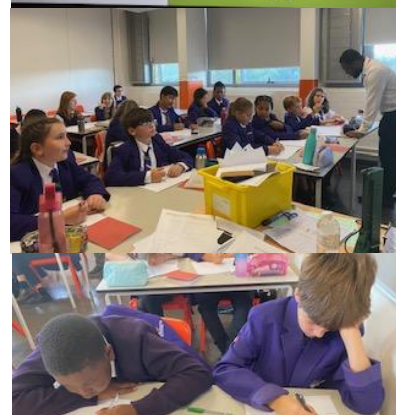
Year 7 concentrating hard in maths too.