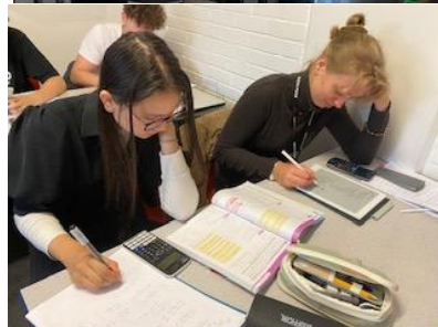
Quiet concentration in A Level Maths lessons