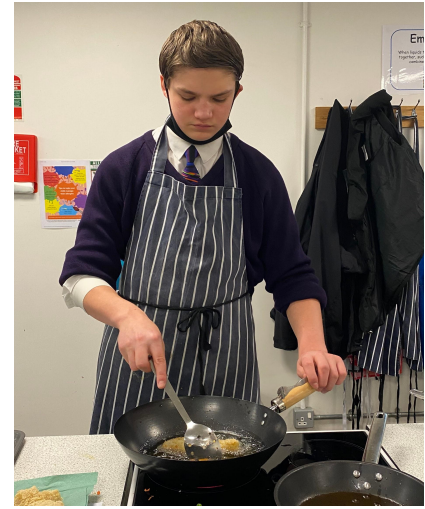
Yr 11 Hospitality Students hard at work.