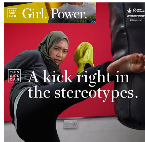
313 Gifts Fundraiser

Girls only lunchtime club Fridays 12:40-1:25 Small Gym Years 7-9