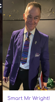
Drama Trip to the Old Vic