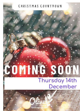
School Christmas Lunch