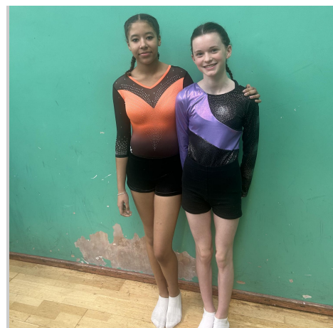
7LGo out at Crown Point on geography fieldwork.