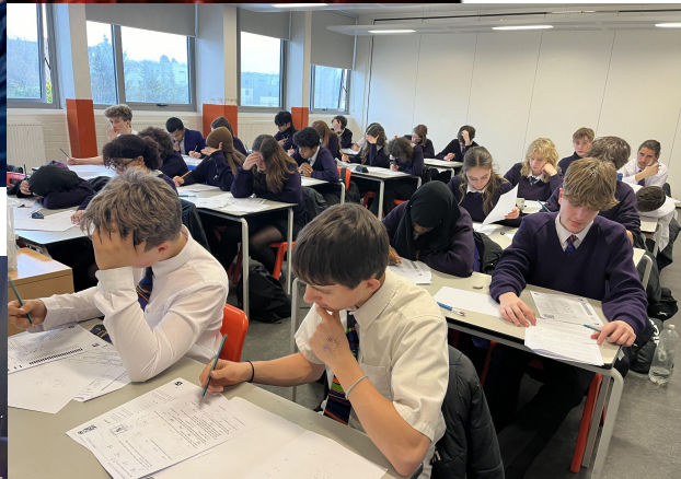
Above - Lots of year 9, 10 and 11 took part in the national UKMT Intermediate Maths Challenge. They really stepped up to the floor with some excellent problem solving skills, and left, Debate Mate students really pushed themselves and found last week's trip a very rewarding experience.