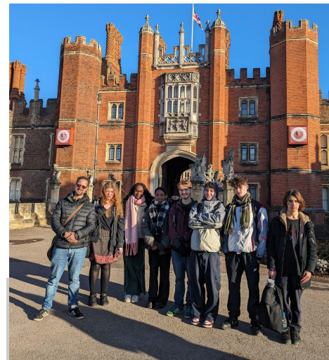
Sixth Form Shakespeare in the 'garden'