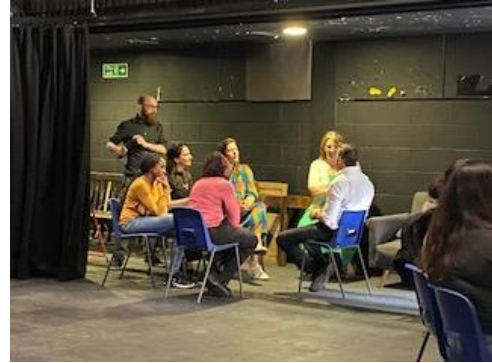
Friendship Tea Party Year 6 Parents joining in!