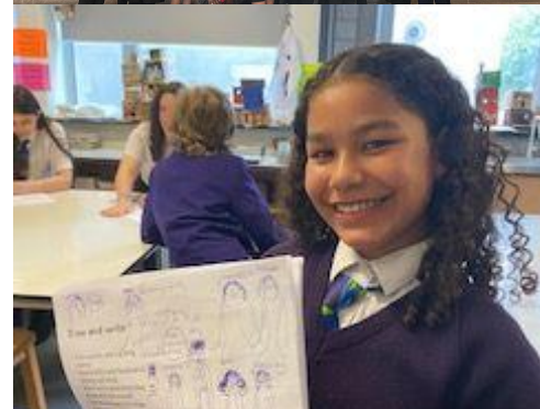
Year 7 Learning for Ilfe