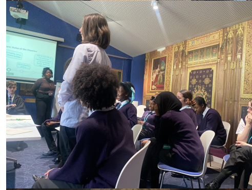
Year 10 Trip to Parliament