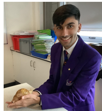
Students enjoy weird and exotic creatures in Science thanks to Jack Petchey funding