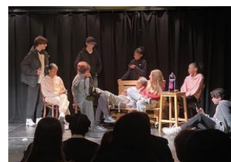
Wonderful Key Stage 3 Plays