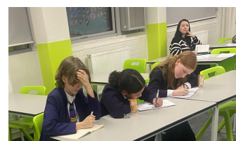
Great Debate Mate participation from our younger students