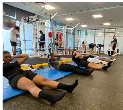
Basketballers visits Worcester Uni

Thanks to a great team of parents who were in on Saturday and this week, helping staff with set, props and costumes for The Wiz - great team effort!