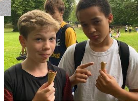
Students enjoying our big days out this week