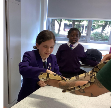
Wild Science with Yr 7