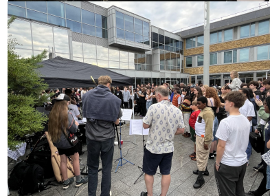
Vibrant Cultural Evening