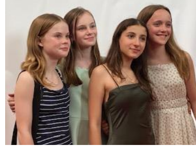
Great fun at the Papas.