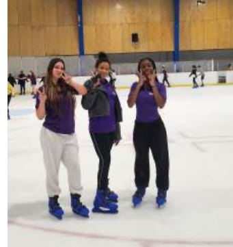
House Day fun!