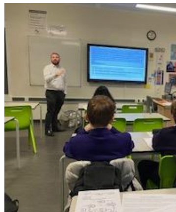
Taming of the Shrew with Year 9