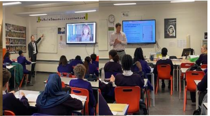
Teaching in Humanities