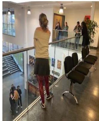
Romeo and Juliet Balcony Scene