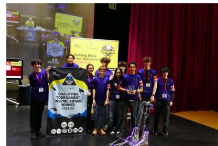
Norwood Industries, Inspire Award Winners and Captains of the Winning Robot Alliance