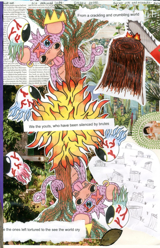
From a crackling and crumbling world