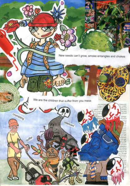
New seeds can't grow, smoke entangles and chokes